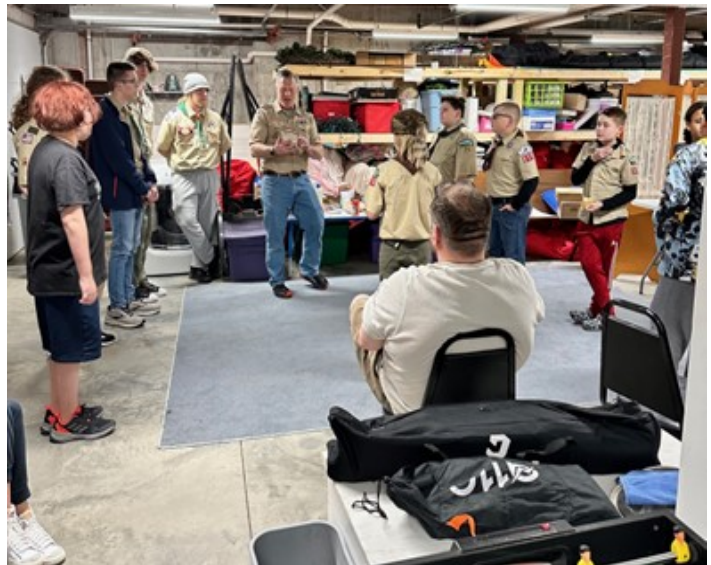
Troop 75 meeting in basement to review cooking merit badge requirements.