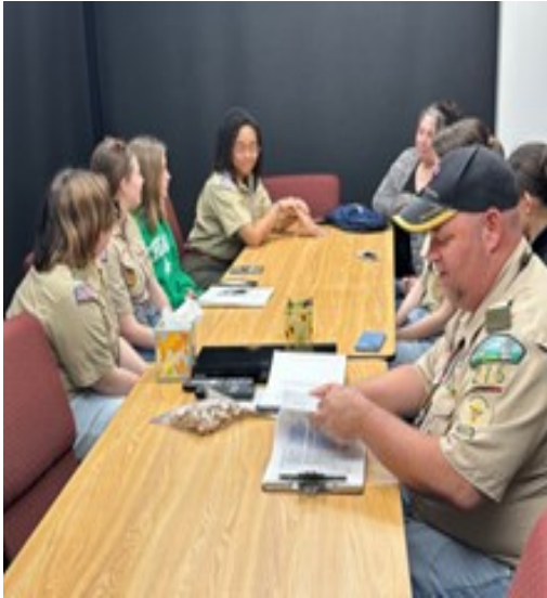
Troop 275 girls meet in the conference room