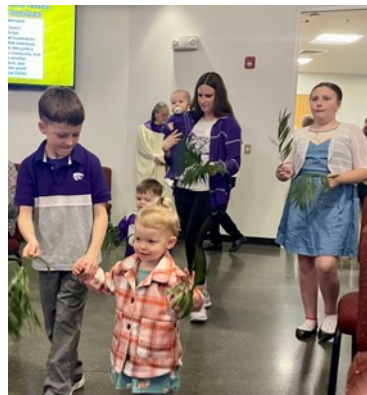
Palm Sunday Processional